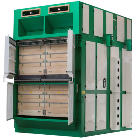
E50 with double flow set-up

The CC high capacity modular cleaner is a very versatile cleaner applicable for many high capacity cleaning purposes